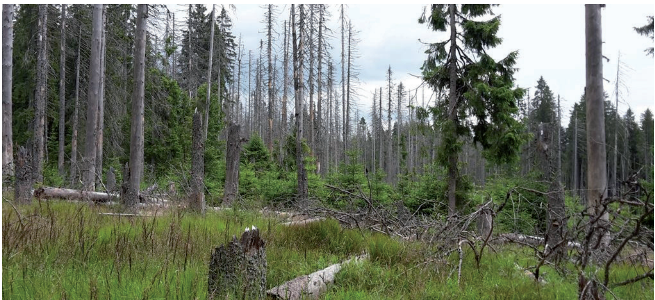
Fig. 3 "Grey" forest about 10 years after the bark beetle attack, in which natural regeneration of the forest is occurring.

ment area in the surroundings of Březník, which is in an unmanaged forest zone. In this area it is possible to determine whether floods and droughts are more likely where the forest is dead. The catchment area of Modravský potok includes three areas: one covered with green forest, one with dead forest and one with clearings and other land. The run-off from these areas was measured using a limnigraph above Modrava village and the amount of precipitation was obtained from a nearby meteorological station (Filipova Huť). The data for this study was collected from 1971–2015. Changes in the precipitation /run-off ratio would indicate that forest clearings have an effect. However, the annual run-off of the Modravský potok did not change (Hruška et al. 2016). The increase in run-off in March and April could have been caused by several factors (Hais et al. 2006). This could be partly due