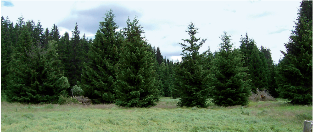
Fig. 2 Green forest without signs of damage in the unmanaged zone.

in the initial phases after the attack, before the massive re-growth of new trees occurs. But what about forest that has been clear cut to stop a bark beetle attack?