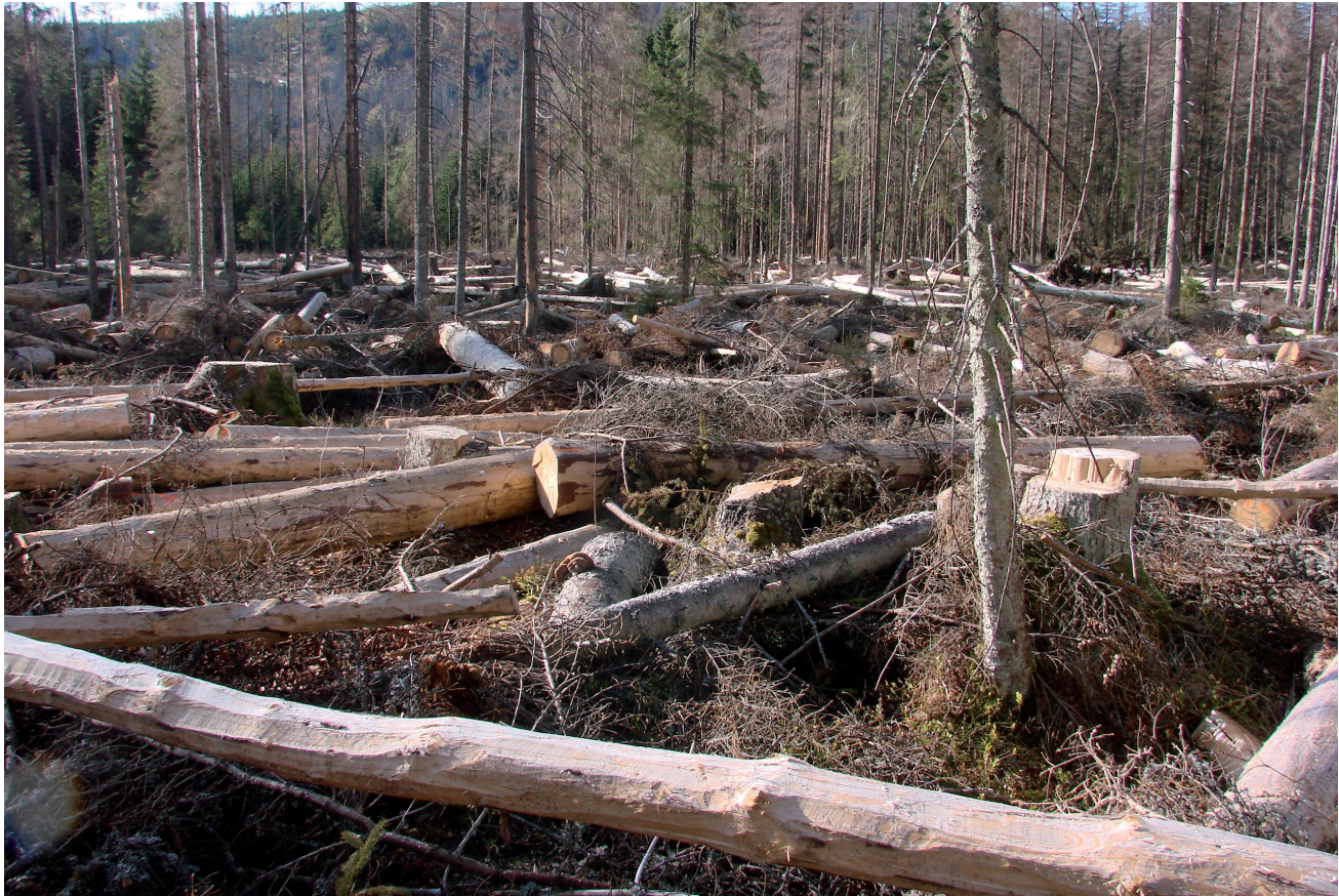
Fig. 4 Clear felling aimed at stopping the bark beetle from spreading.

to a change in the vegetation cover as snow in treeless landscapes or in forest without mature trees is not shaded and melts earlier. Furthermore, an evident air temperature increase causes an earlier snow melt in the Czech Republic and that's why the spring maximum run-offs shift from April/May to March/April in mountainous areas (Hruška et al. 2016).