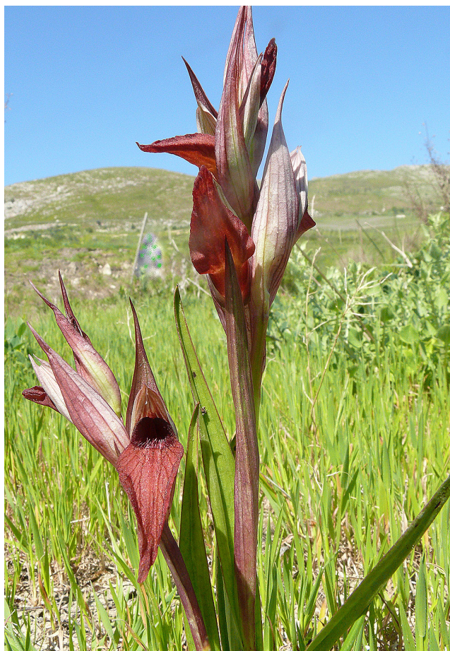
Fig. 5 Serapias vomeracea.