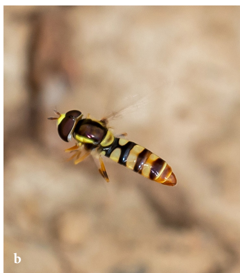
Fig. 3 Epipactis veratrifolia (a) and one of its pollinators, Ischiodon scutellaris (b) (Source: wikimedia.org).