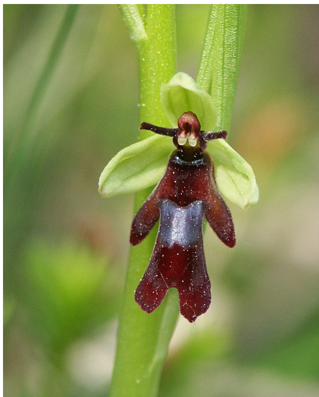
Fig. 2 Ophrys insectifera.

The pollinator lands on the flower and tries to copulate with it, during which the pollinium of the flower sticks to it and is subsequently transported to the next flower it visits (Ayasse et al. 2000). Flowers of these orchids do not only use visual signals, but also scent to at-