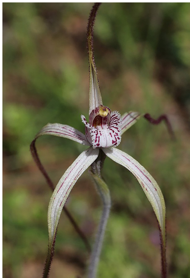
Fig. 6 Caladenia nobilis (Source: chookman.id.au).

bees may also stay in a flower for two nights (Dafni et al. 1981). Compared with Serapias lingua , which uses sexual deception to attract pollinators, the percentage fruit set of Serapias vomeracea is higher (Pellegrino et al. 2017).