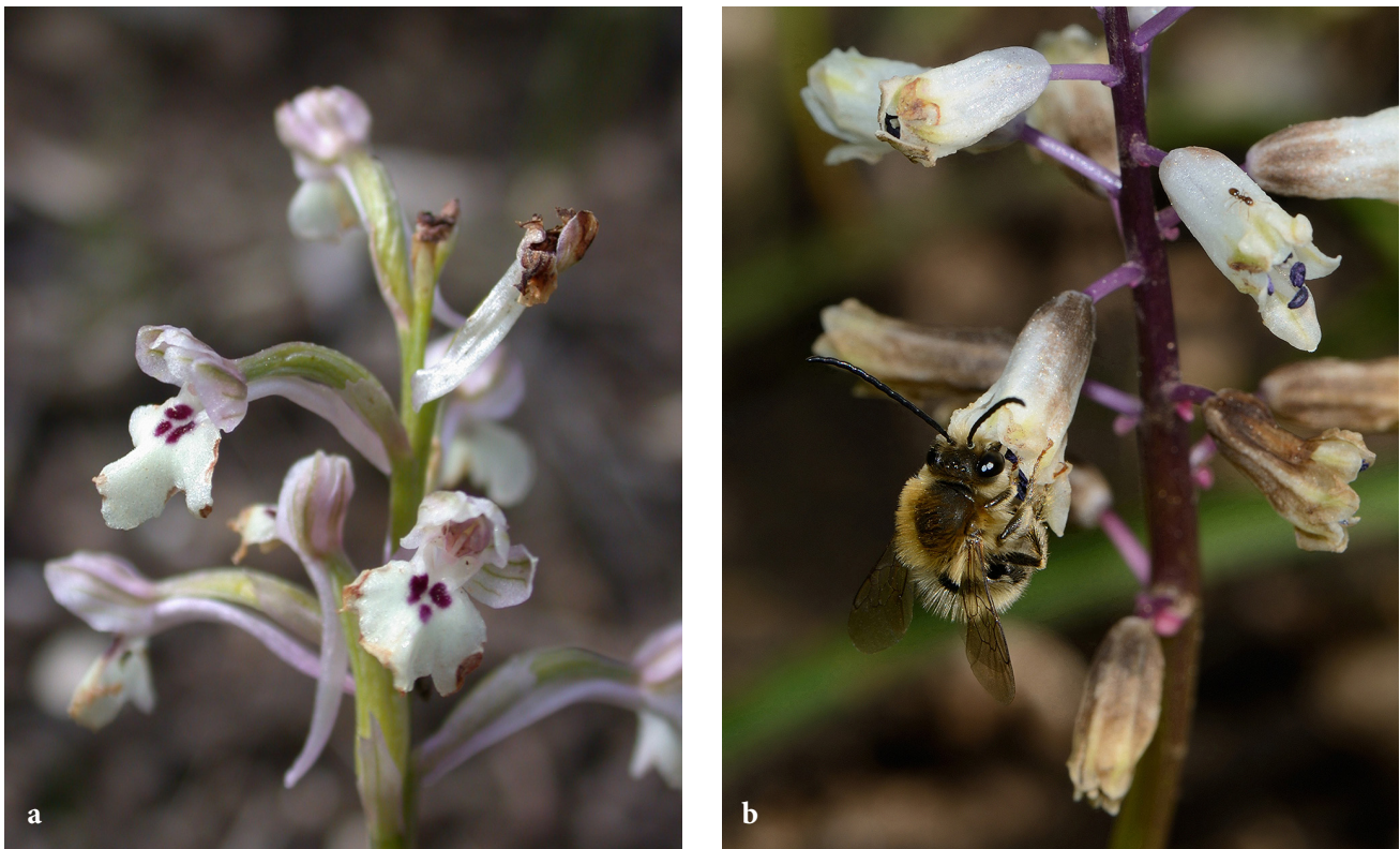
Fig. 4 Orchis israelitica (a) and Bellevalia flexuosa (b) (Source: wikimedia.org).

Epipactis helleborine , emits volatile aldehydes and alcohols. Brodmann et al. (2008) studied whether the social wasps that pollinate this orchid are attracted by visual signals or scent. Pollinators visited more frequently covered flowers that produced scent than visible flowers, which did not (Brodmann et al. 2008). The scent of Orchis israelitica also attracts pollinators, but only over long distances, as when the pollinator is close to the plant, it is attracted by the colour of the flower (Galizia et al. 2005).