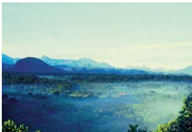
Fig. 2 Panoramic of La Planada nature reserve, Nariño department.