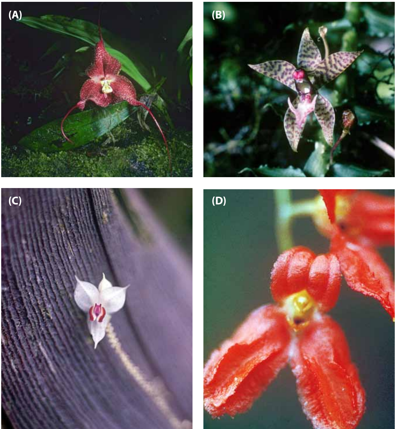
Fig. 7 Examples of endemic and endangered orchids of the cloud forests of the Western Andes: (A) Dracula wallisii , (B) Dichaea hystricina , (C) Lepanthes magnifica , (D) Porroglossum eduardii .

(2004) has published a magnificent catalog of the orchids from Maquipucuna Nature Reserve in Pichincha, Ecuador.