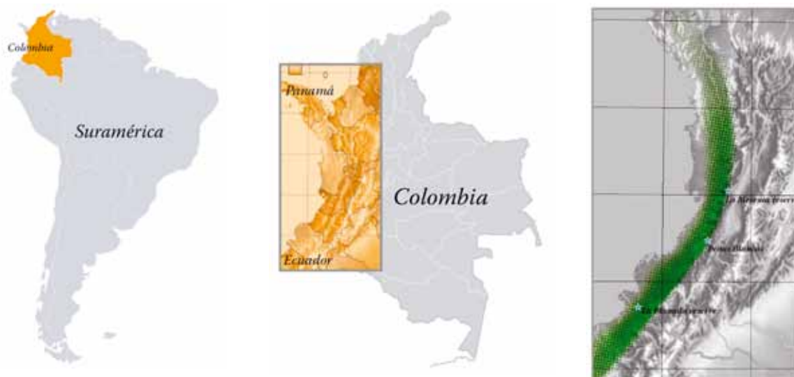
Fig. 1 Map of Colombia with the study areas.

In Colombia, orchids are notorious for being the plant family with the highest number of endangered species (Calderón-Sáenz 2007). The nation's cloud forest species share twice the risk, due to high levels of endemism and the speed at which many ecosystems are being changed to other usage such as for agriculture and livestock (Dixon and Phillips 2007). It is anticipated that an already difficult situation will worsen as a result of global warming (Jarvis 2009).