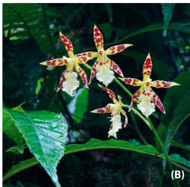
Fig. 8 Examples of endemic and endangered orchids of the cloud forests of the Western Andes: (A) Echinorhyncha vollesii , (B) Oncidium aspidorhinum .