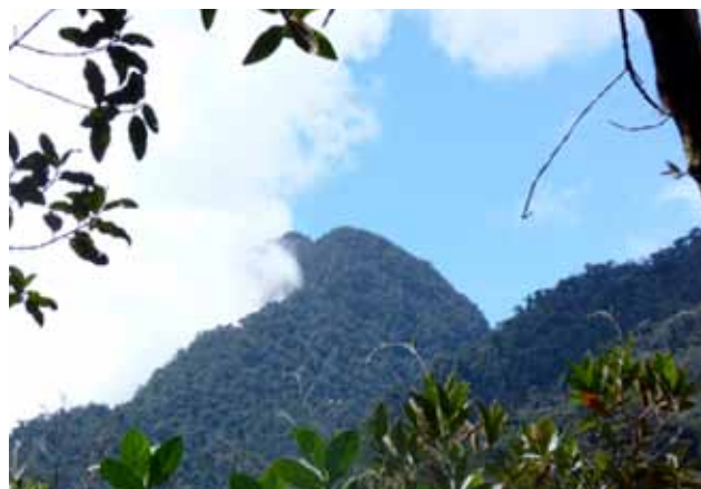
Fig. 3 La Mesenia reserve, Antioquia department.