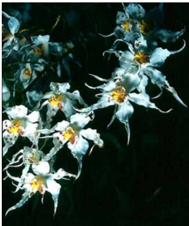
Fig. 5 Endemic orchid species Oncidium cirrhosum .

Nature reserve systems should also include civil society (private sector) along with territories that have tra-