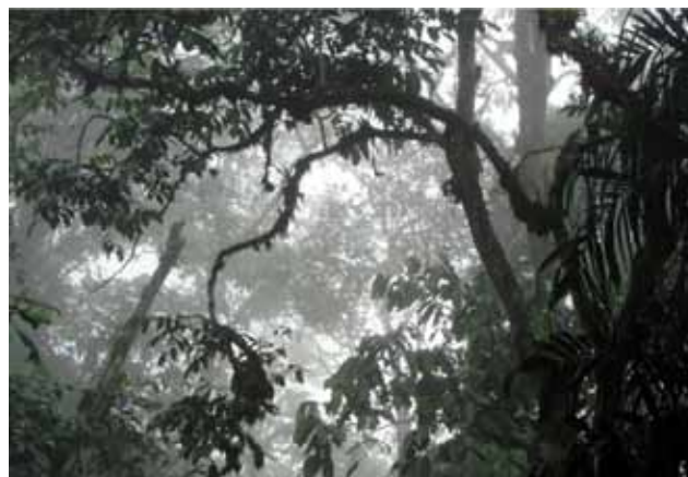
Fig. 4 Cloud forest in the Farallones de Cali National Park. Cali.

The extraction of wild orchids with economic value and for exhibition, although illegal today, still continues to reduce many species to local extinction. These activities have significantly diminished natural populations of species from the genera Cattleya , Coryanthes , Anguloa , Dracula , Stanhopea , Oncidium , and Masdevallia . In some cases, species have been exploited almost to local extinction. Contrary to the belief that CITES (the Convention on International Trade in Endangered Species of Wild Fauna