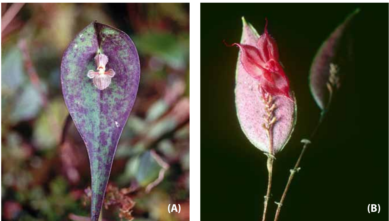
Fig. 10 Some species recently described or waiting description from the Western Andes of Colombia: (A) Pleurothallis perryii , (B) Lepanthes lycocephala .

support for conservation projects. Two key organizations are Conservation International and the World Conservation Union (IUCN), which has a group of orchid specialists and an orchid conservation education panel. There are several other institutions such as the American Orchid