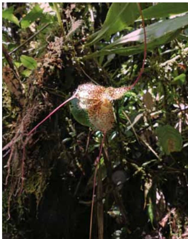
Fig. 6 Endemic orchid Dracula chimarca .

ditional settlements, including indigenous reserves, afro-colombian communities and rural reserves.