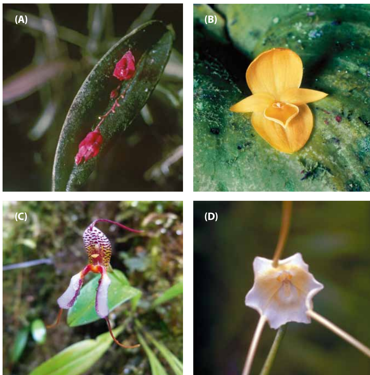
Fig. 11 Some species recently described or waiting description from the Western Andes of Colombia: (A) Lepanthes planadensis , (B) Pleurothallis titan , (C) Masdevallia hortensis , (D) Dracula levii .